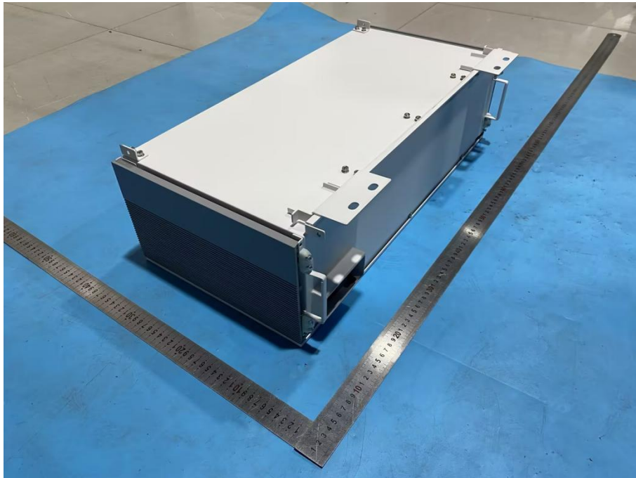
Photo 2 电池组背面 Back view of battery