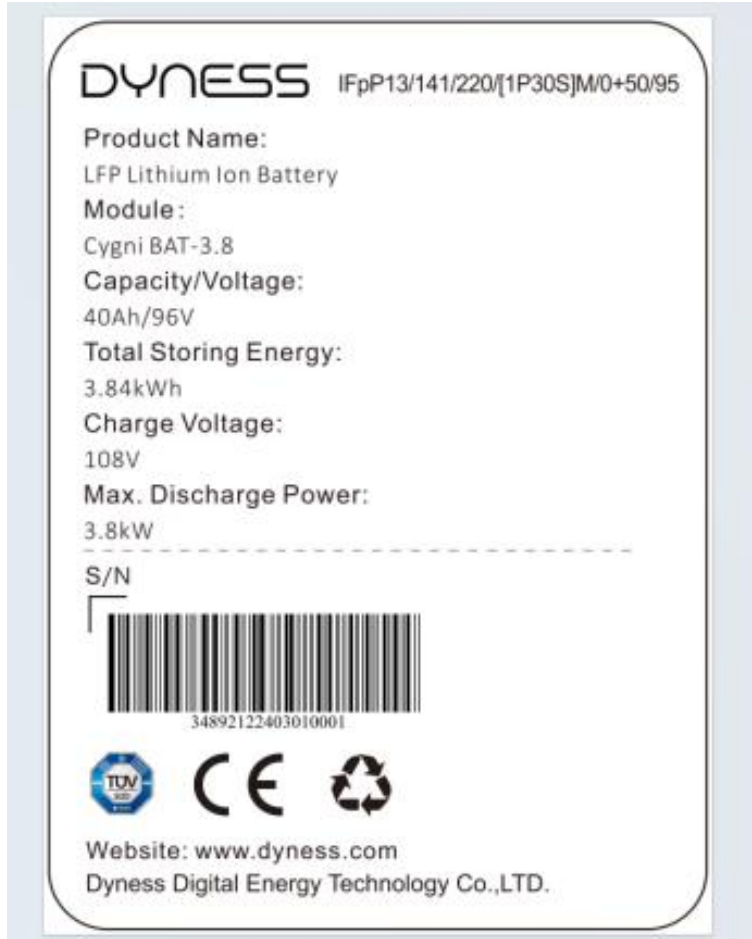
Photo 3 标签特写 Label close-up