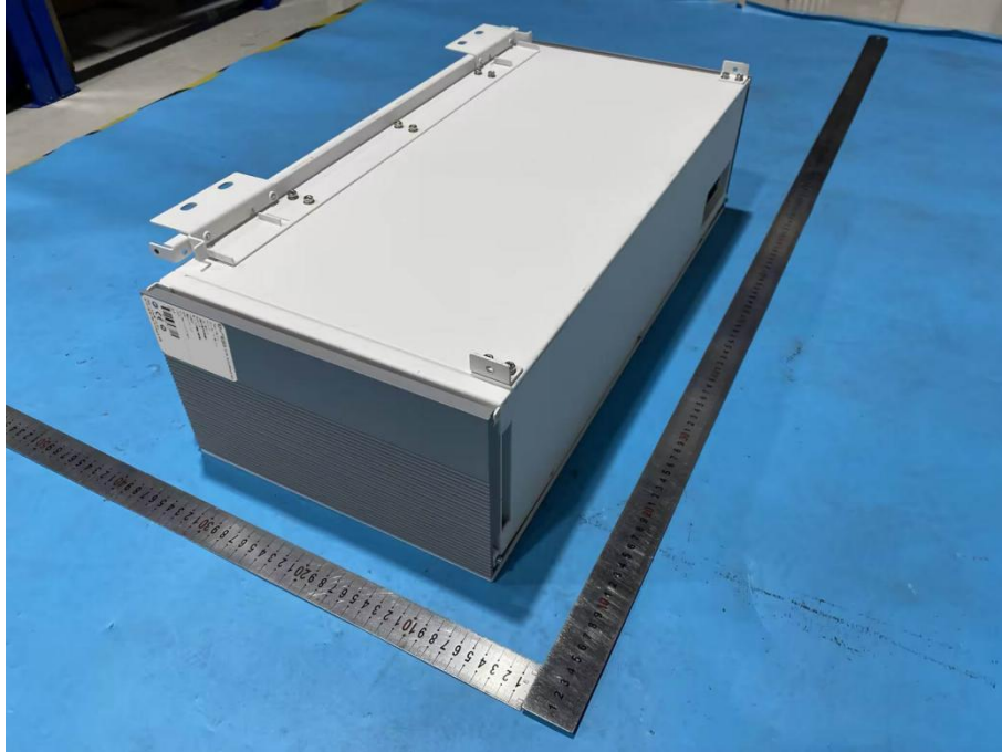
Photo 1 电池组正面 Front view of battery