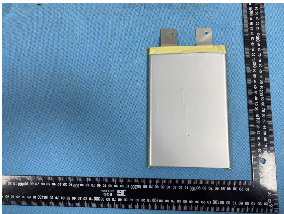
Photo 5 电池背面 Back view of Cell