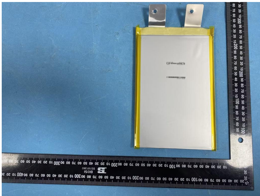
Photo 4 电池正面 Front view of Cell