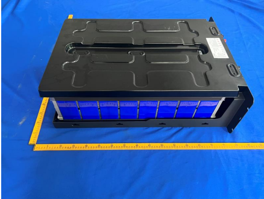
样品图片 (Sample photograph) -4