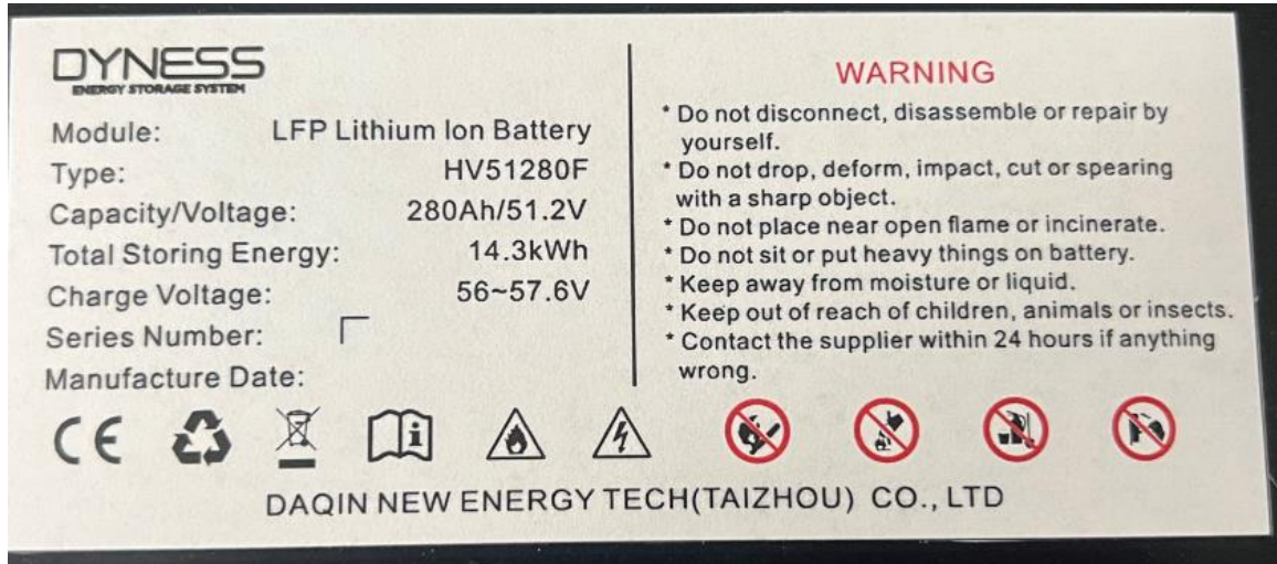
样品图片 (Sample photograph) -8