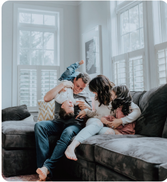
Household conventional electricity